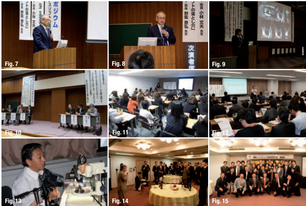
Figs. 7 & 8 _Announcement from President of AIAI to many people. Figs. 9 & 10 _Sinus symposium. Figs. 11 & 12 _Lectures for hygienists and dental technicians. Figs. 13 _The seminar of the hands on for dental technician also was hold in other room. Figs. 14 & 15 _Social Gathering Party.

Many friends and colleagues of AIAI will take part, too because it will be possible to have Japanese simultaneous interpretation for the lectures. In addition, he called to the AIAI-members which are having authority or a clinical certificate of AIAI in Japan, to become Expert and Specialist of DGZI. In Germany and in Japan it is so venerable to hold such a certificate of DGZI.